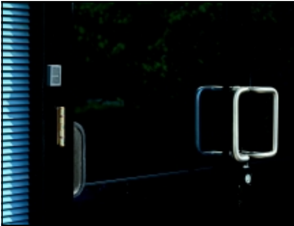
Detachable antenna unit shown mounted away from the control unit.